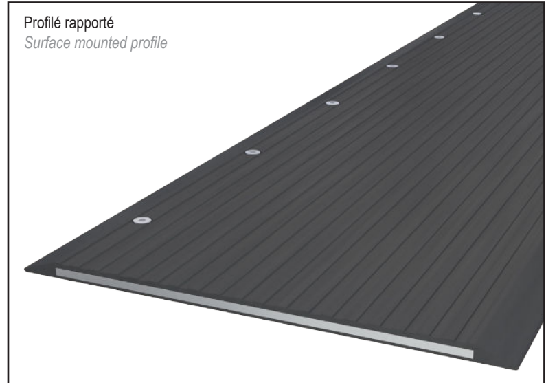
Profilé rapporté Surface mounted profile

Floor expansion joint for car parks, access ramps, esplanades and any other place with or without traffic of slow light-vehicles. SBR/NR rubber finish in order to reduce the shock noises.