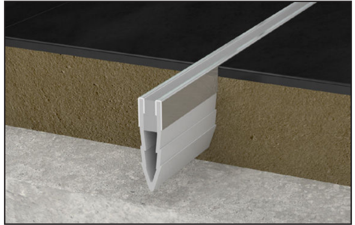
JF 700/S gris / JF 700/S grey

They are supplied with stainless steel or brass caps for a more luxurious finish.