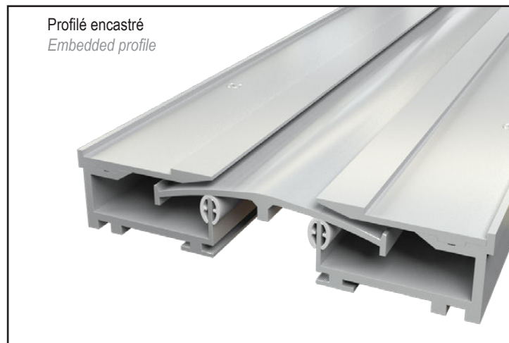
JDH 6.26-050 A avec cornière invisible With invisible side plate