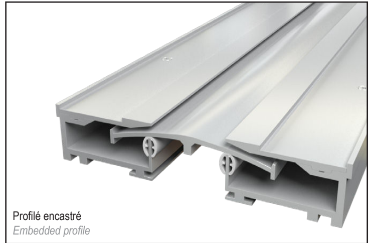
Profilé encastré Embedded profile